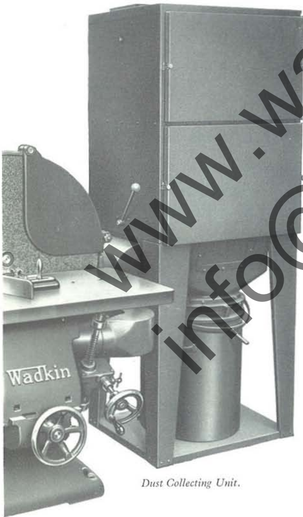
Dust Collecting Unit.