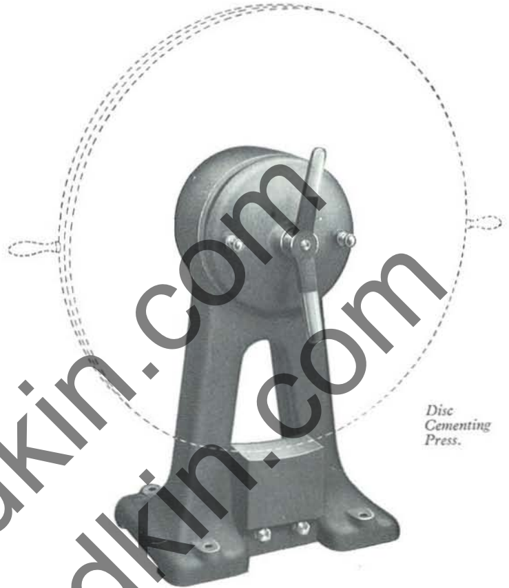
Disc Cementing Press.

Control gear for motors ; One steel disc 30" diameter ; One split metal bobbin, 3½" diameter ; One filling-in ring for 3½" bobbin ; One universal swivelling fence ; Dust exhaust hood and guard to disc ; Dust exhaust connection to bobbin ; Disc press and two spare steel discs ; One set of spanners ; Lubricating pump and tin of ball bearing lubricant.